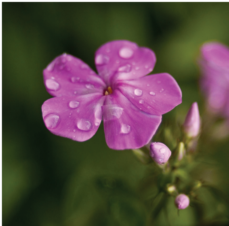
Focusing in on a single bloom makes the everyday flowers in your garden an eye-popping picture. Learn more about making the most of your digital photography with Digital Answers on page 14.